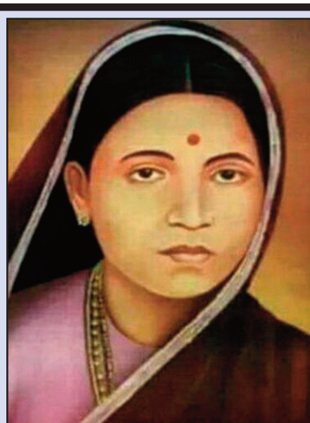
Ambedkar Times pays floral tribute to honorable Mata Ramabai ji on her Pririvan Divas who was first wife of Bharat Rattan Babasaheb Dr. B. R. Ambedkar and she played an important role in making him a great man. Editor: Ambedkar Times